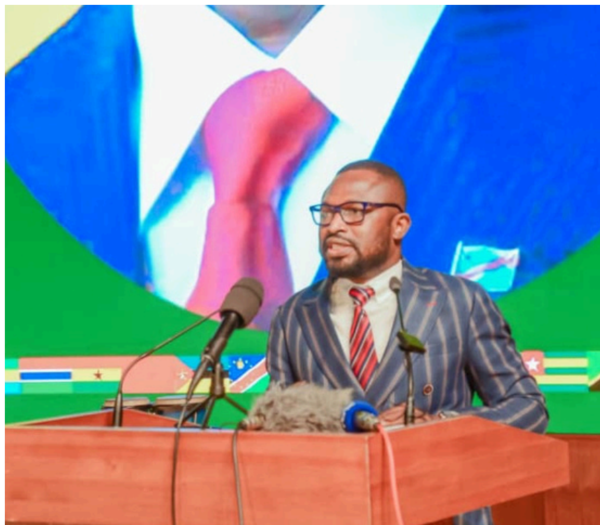
Secretary-General of the Pan-African Youth Union, Mr. Bening Ahmed Wiisichong, giving remarks at the Summit of Africa Youth Leaders on 31 August 2024 in Kinshasa

The aspirations of African Union Agenda 2063 and United Nations agenda 2030 are only achievable within a climate of peace and stability. That is why the silencing the guns initiative is of paramount importance to the socio-politico-economic development of the continent and building the Africa we truly want.