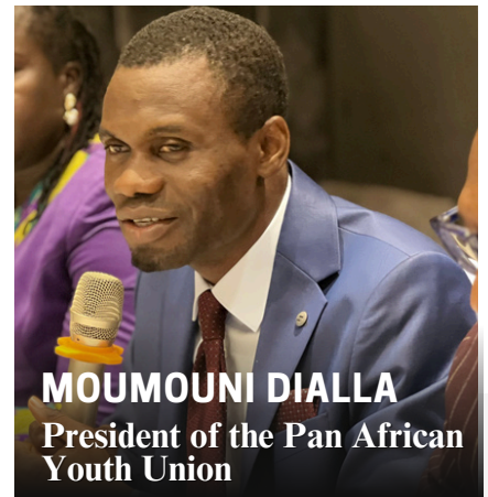
MOUMOUNI DIALLA President of the Pan African Youth Union